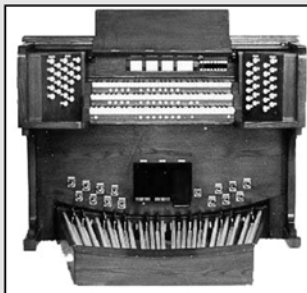
Phoenix Custom Organs The new standard of excellence

Every Phoenix Organ is custom built to best suit the needs of your congregation.