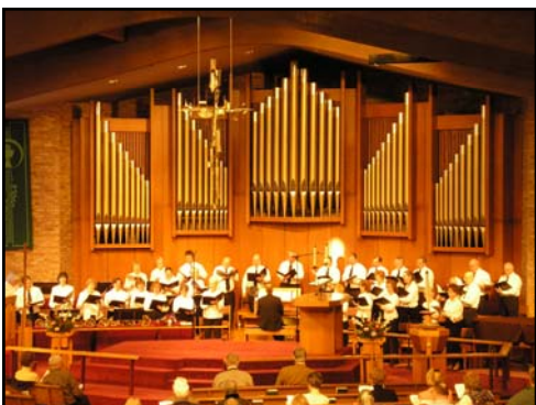
Good Shepherd Lutheran Church, Madison, graciously hosted the recent Hymn Festival.