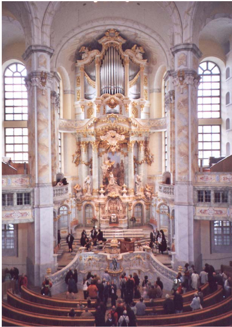
Pictured above is the altar area and organ of the Frauenkirche in Dresden.

While in Dresden, we stayed at the Apartments an der Frauenkirche, which I found on the internet, and when the taxi dropped us off in a courtyard opposite the Frauenkirche, our mouths dropped! This essentially 18 th century city offers much in music and the arts, all within easy walking distances. There is so much music making going on all the time. There is the Frauenkirche (Church of our Lady), the Kreuzkirche (Holy Cross Church), and the Hofkirche (Court Church) for splendid organ and choral music. The Semper Opera House, built in 1878, has a rich history with many famous composers. Nine operas of Richard Strauss were performed for the first time there. There is also the modern Dresden Philharmonic Orchestra Hall. There are several excellent church and city choirs. One can visit any week in the year and have numerous worship and concert opportunities. In the Zwinger and in the Royal Palace there are fantastic collections of Renaissance and Baroque art.