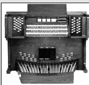
Phoenix Custom Organs The new standard of excellence

Every Phoenix Organ is custom built to best suit the needs of your congregation.