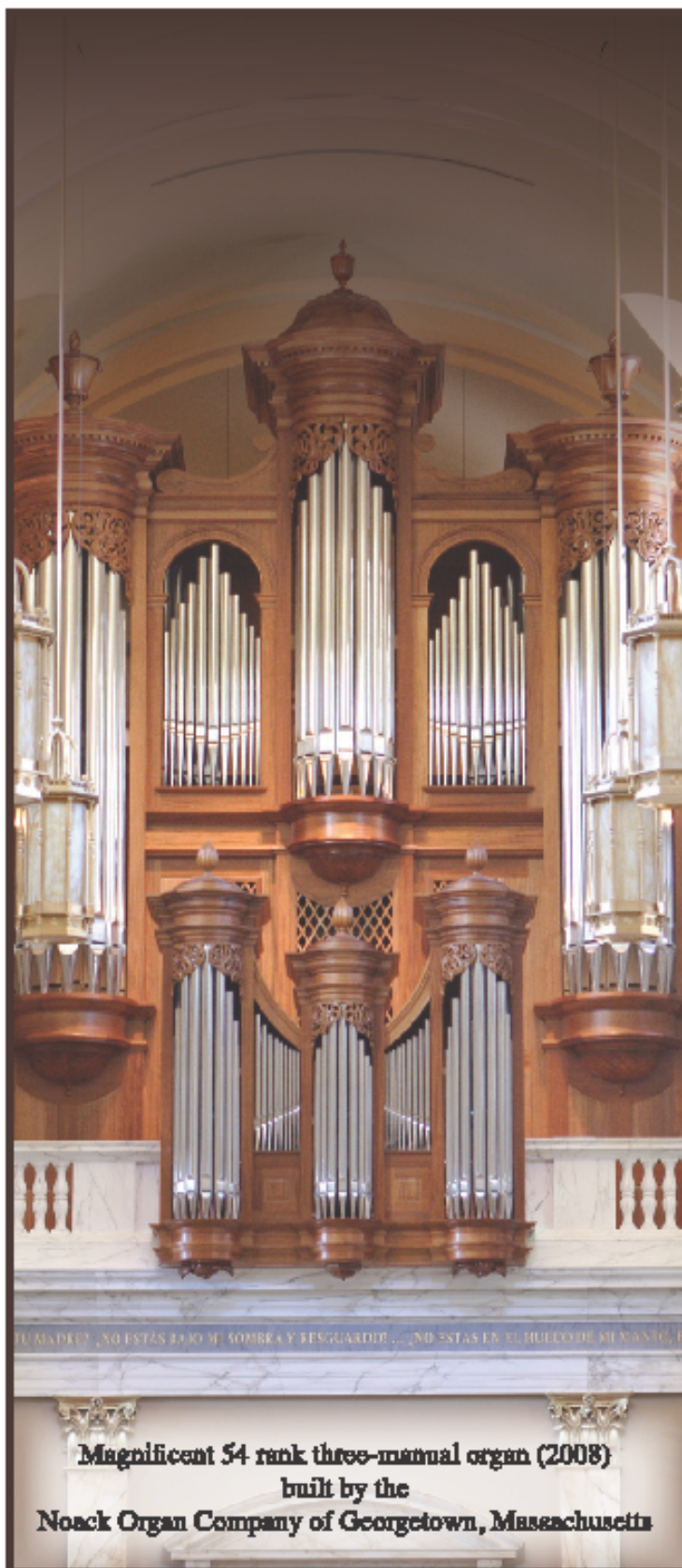
Magnificent 54-rank three-manual organ (2008) built by the Noack Organ Company of Georgetown, Massachusetts