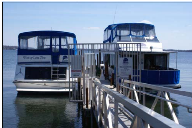
Above, The Betty Lou Cruise ships await us at their dock on Lake Monona.