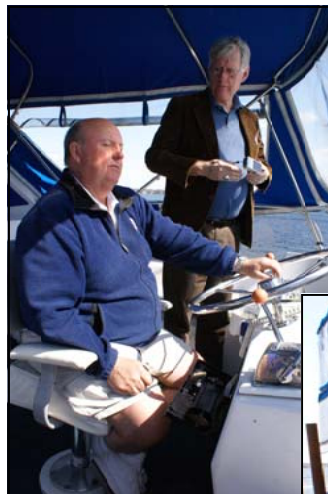
Our Captain (at left) and Crew (below) made sure we had an enjoyable outing.