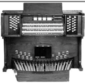
Phoenix Custom Organs The new standard of excellence

1. A thing of unsurpassed excellence or beauty.