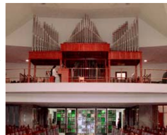
Queen of the Rosary Chapel