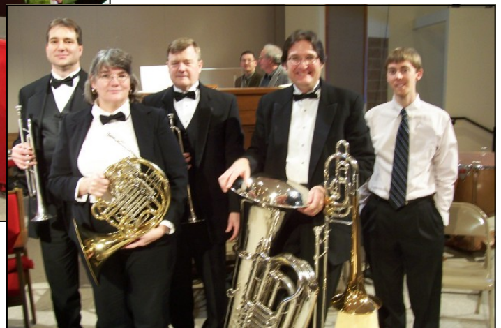
Pictured above is Brassworks, a group which accompanied hymns and anthems and also contributed solo instrumental works to the program.