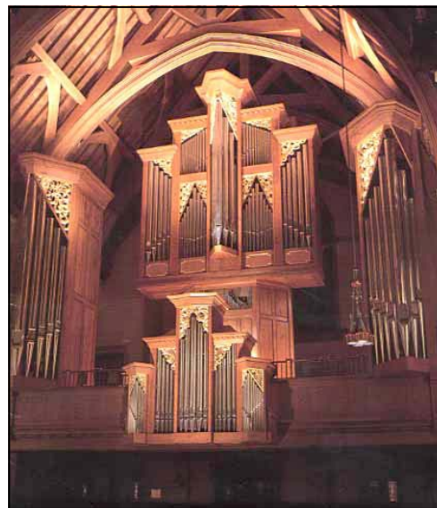
Venues for the AGO Convention include the House of Hope Presbyterian Church and its 1979 Fisk mechanical action pipe organ, pictured above.

The TCAGO is excited to host this convention and offers a warm welcome to all. For more information, go to the conference website at http://www.ago2008.org .